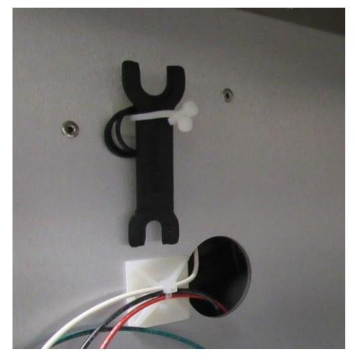
Push collet in with tool to remove hosing